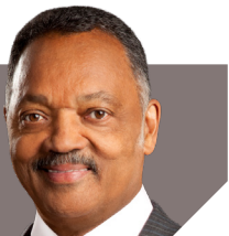
Reverend Jesse Jackson US Civil Rights Icon & First Black Presidential Candidate