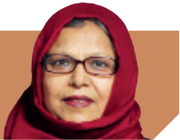
Baroness Pola Uddin House of Lords

“Tower Hamlets was once transformed by Labour. But today's administration is more reminiscent of the era of hopelessness and service failures that me and my colleagues fought against in the discredited Liberal administration. A borough famed for opposing fascism and racism appears to no longer address their corrosive effects. As the first Bangladeshi woman councillor and a former deputy council leader, I can see that now, more than ever, we need a dynamic visionary mayor who puts this borough first. Take this opportunity to vote for change.”